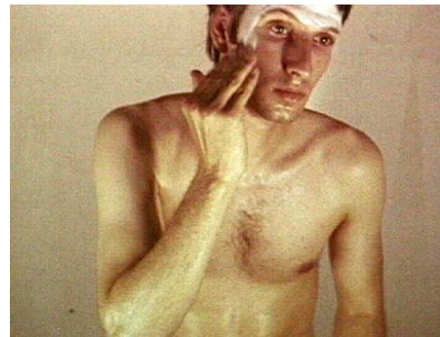
Figure 3. Nauman, Bruce Art Make-Up: No. 1 White, No. 2 Pink, No. 3 Green, No. 4 Black , 1968 16mm film transferred to video (color, sound), 40 min. MOMA

Similar to Iveković, Bruce Nauman also showcases makeup application for the camera in his video series, Art Make-Up , but unlike Iveković, Nauman’s interest in the subject stemmed from his questioning of what artists do, what art is, and how it is made. His four-segment piece each lasting ten minutes, depicts Nauman shirtless and visible from the torso up. He applies the colored makeup