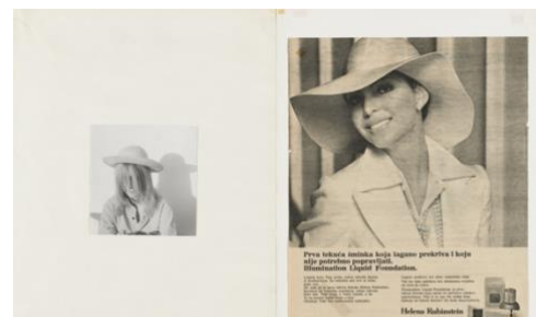
Fig. 1. Iveković, Sanja. Vacation on the Island of Silba, September 1969 / “Svijet,” November 1976, 1976 Gelatin silver print, magazine page and typewritten text by the artist MOMA

Along with corporations like Dove, many artists have taken to video art to tackle the subject of idea beauty and have served as inspiration for how I approached my project. Born in 1949, Croatian artist Sanja Iveković's work, particularly in the 70s, has served to respond to popular culture and feminine self-image and question