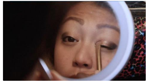
Figure 4 McCann, Ishbel, Facing the World , 2018 Video (color, sound) Collection of the artist.

Whereas the camera position in Make-up – Make-down acts like a mirror facilitating a space for self-reflection, in Facing the World , the camera instead points towards the mirror in a more voyeuristic approach. Doing so, I invite the viewer into an intimate, authentic setting